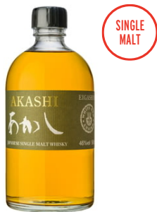
WHISKIES AKASHI SINGLE MALT