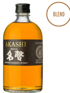
WHISKIES AKASHI MEISEI