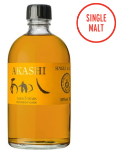
WHISKIES AKASHI SINGLE MALT 5 YEAR OLD BOURBON CASK