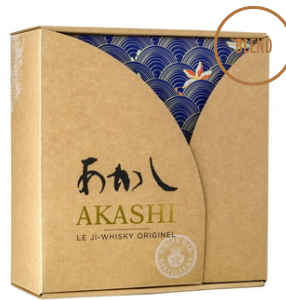
WHISKIES AKASHI MEISEI GIFT PACK