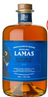
WHISKIES LAMAS PUTUMUJU